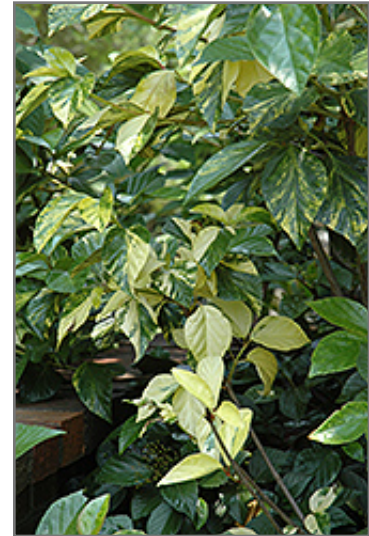
Variegated Japanese Viburnum foliage

Variegated Japanese Viburnum is recommended for the following landscape applications;