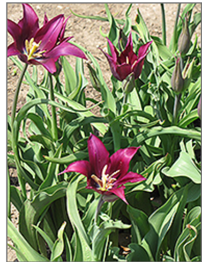
Purple Dream Tulip flowers