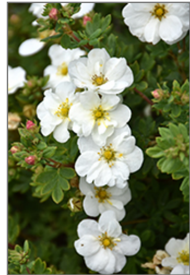
Frosty Potentilla flowers