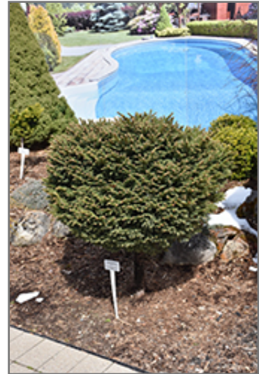
Little Gem Spruce (tree form)