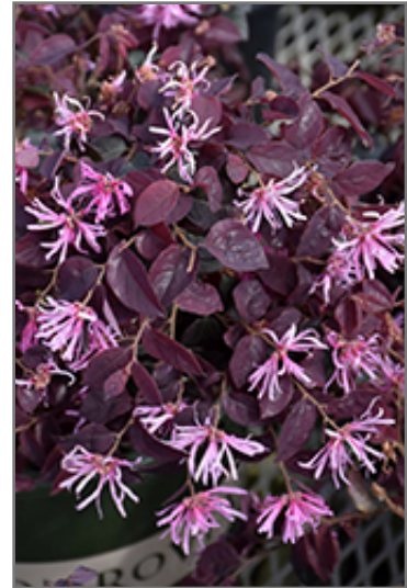
Sizzling Pink Chinese Fringeflower flowers