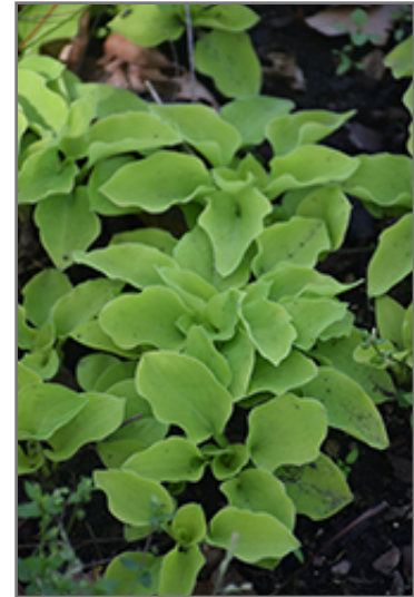
Limey Lisa Hosta