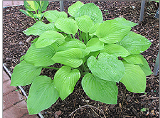
Golden Sunburst Hosta