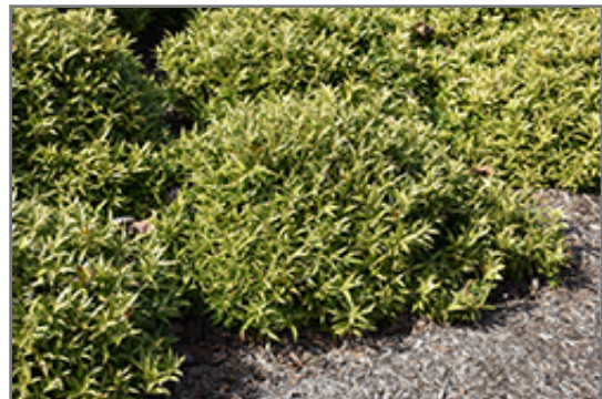
Dwarf Sweet Box