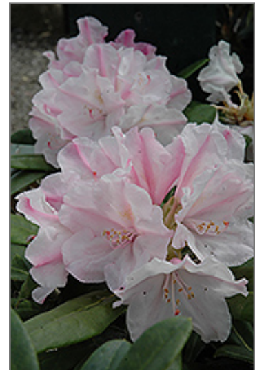
Wisley Rhododendron flowers

Wisley Rhododendron will grow to be about 5 feet tall at maturity, with a spread of 5 feet. It tends to be a little leggy, with a typical clearance of 1 foot from the ground, and is suitable for planting under power lines. It grows at a slow rate, and under ideal conditions can be expected to live for 40 years or more.