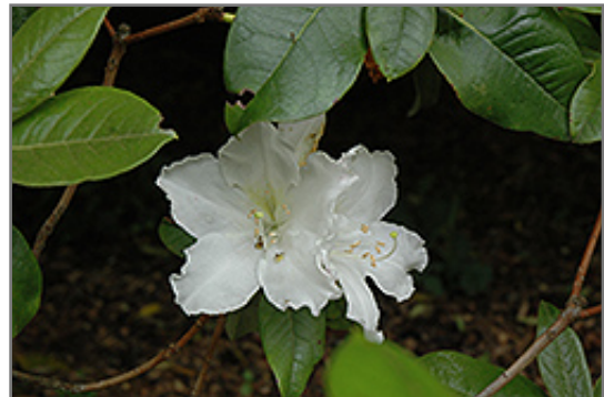
D. Stanton Rhododendron flowers

D. Stanton Rhododendron will grow to be about 6 feet tall at maturity, with a spread of 6 feet. It tends to be a little leggy, with a typical clearance of 1 foot from the ground, and is suitable for planting under power lines. It grows at a slow rate, and under ideal conditions can be expected to live for 40 years or more.