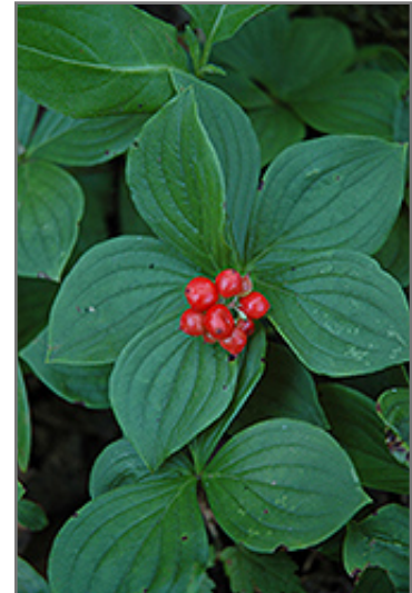
Bunchberry fruit