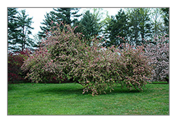
Bob White Flowering Crab in bloom

This is a high maintenance tree that will require regular care and upkeep, and is best pruned in late winter once the threat of extreme cold has passed. Gardeners should be aware of the following characteristic(s) that may warrant special consideration;