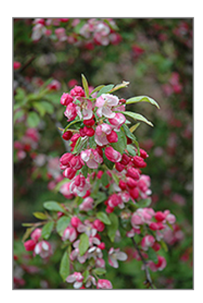
Bob White Flowering Crab flowers