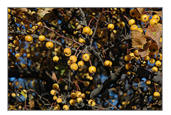
Bob White Flowering Crab fruit

This tree should only be grown in full sunlight. It prefers to grow in average to moist conditions, and shouldn't be allowed to dry out. It may require supplemental watering during periods of drought or extended heat. It is not particular as to soil type or pH. It is highly tolerant of urban pollution and will even thrive in inner city environments. This particular variety is an interspecific hybrid.