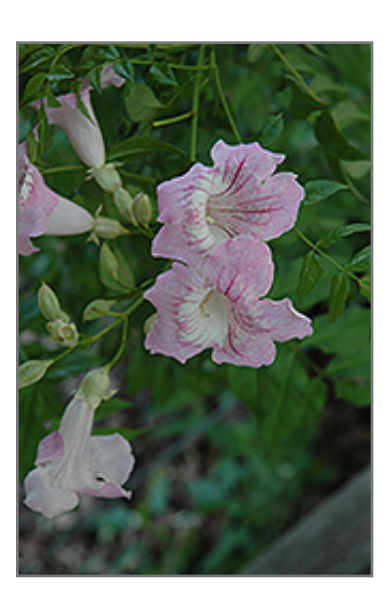
Queen Of Sheba Vine flowers

-- THIS IS A TROPICAL PLANT AND SHOULD NOT BE EXPECTED TO SURVIVE THE WINTER OUTDOORS IN OUR CLIMATE --