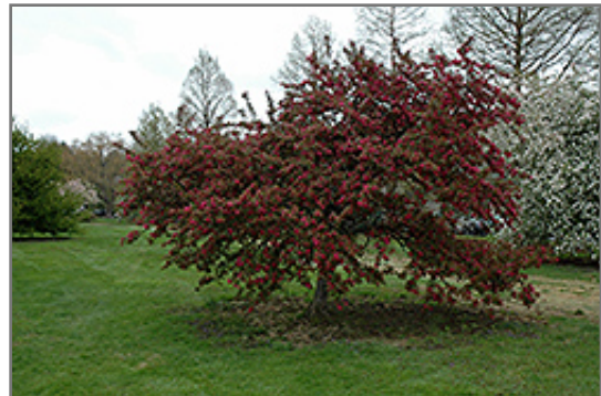
Indian Magic Flowering Crab in bloom