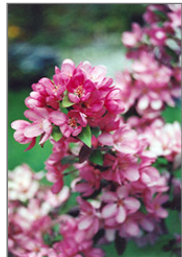
Indian Magic Flowering Crab flowers