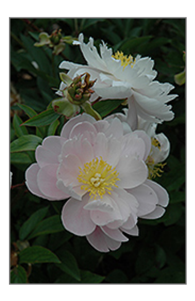
Elisa Peony flowers

Elisa Peony will grow to be about 30 inches tall at maturity, with a spread of 3 feet. When grown in masses or used as a bedding plant, individual plants should be spaced approximately 30 inches apart. The flower stalks can be weak and so it may require staking in exposed sites or excessively rich soils. It grows at a slow rate, and under ideal conditions can be expected to live for approximately 20 years. As an herbaceous perennial, this plant will usually die back to the crown each winter, and will regrow from the base each spring. Be careful not to disturb the crown in late winter when it may not be readily seen!