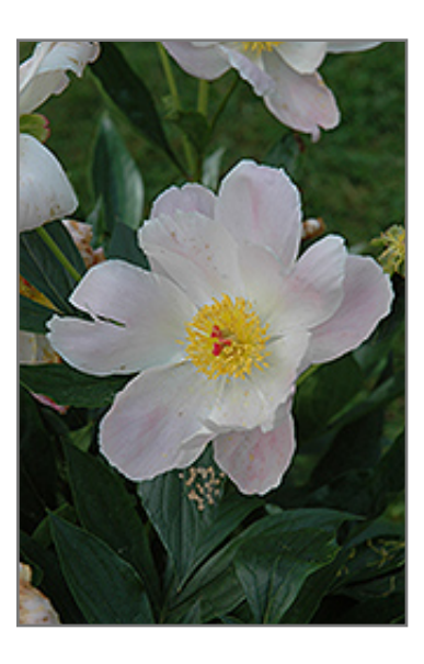
Duchess of Portland Peony flowers

Duchess of Portland Peony will grow to be about 30 inches tall at maturity, with a spread of 3 feet. When grown in masses or used as a bedding plant, individual plants should be spaced approximately 30 inches apart. The flower stalks can be weak and so it may require staking in exposed sites or excessively rich soils. It grows at a slow rate, and under ideal conditions can be expected to live for approximately 20 years. As an herbaceous perennial, this plant will usually die back to the crown each winter, and will regrow from the base each spring. Be careful not to disturb the crown in late winter when it may not be readily seen!