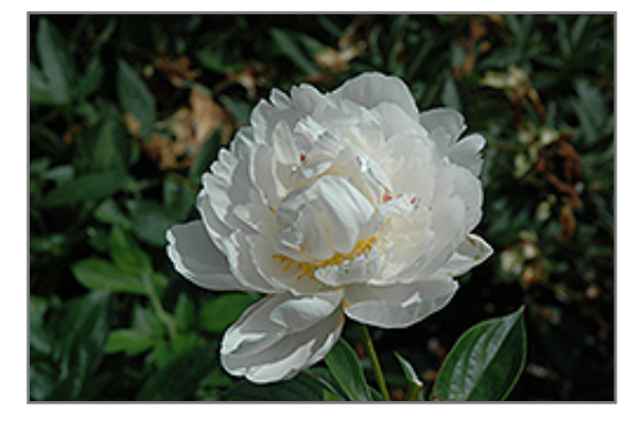
Rose Shaylor Peony flowers