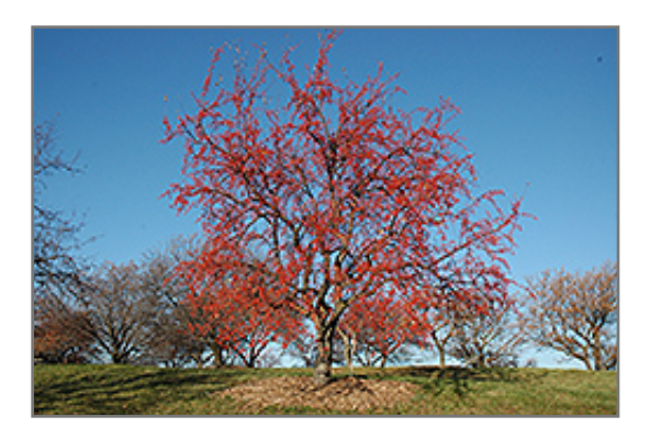
Red Splendor Flowering Crab in fall

Red Splendor Flowering Crab is recommended for the following landscape applications;