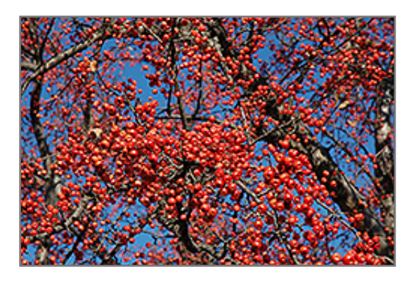
Red Splendor Flowering Crab fruit

This tree should only be grown in full sunlight. It prefers to grow in average to moist conditions, and shouldn't be allowed to dry out. It may require supplemental watering during periods of drought or extended heat. It is not particular as to soil type or pH. It is highly tolerant of urban pollution and will even thrive in inner city environments. This particular variety is an interspecific hybrid.