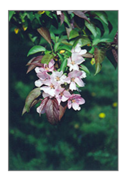
Red Splendor Flowering Crab flowers

8546 Sun Valley Road Anytown, USA 12345 204.782.4147