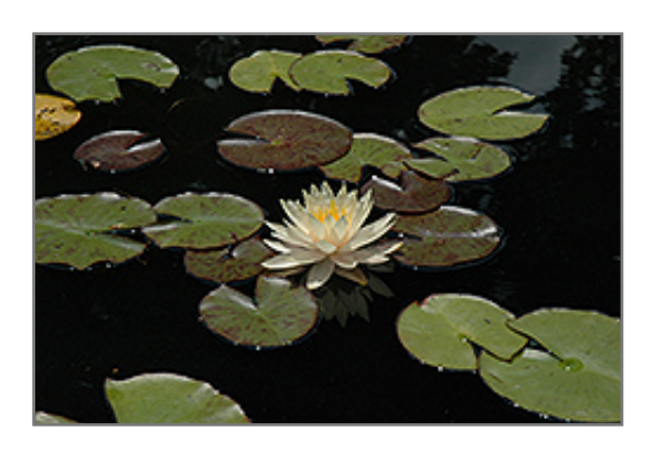
William Falconer Hardy Water Lily flowers