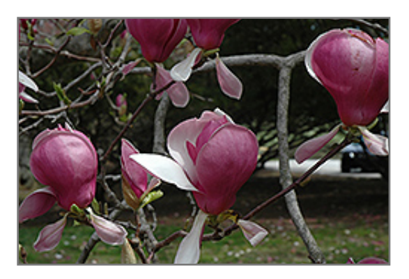
Lennei Saucer Magnolia flowers

Lennei Saucer Magnolia will grow to be about 20 feet tall at maturity, with a spread of 20 feet. It has a low canopy with a typical clearance of 3 feet from the ground, and is suitable for planting under power lines. It grows at a medium rate, and under ideal conditions can be expected to live for 80 years or more.