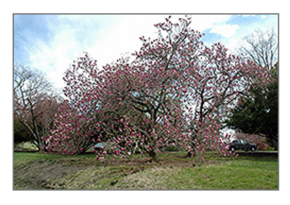
Lennei Saucer Magnolia in bloom