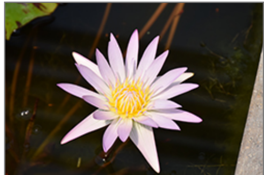
Madame Ganna Walska Tropical Water Lily flowers