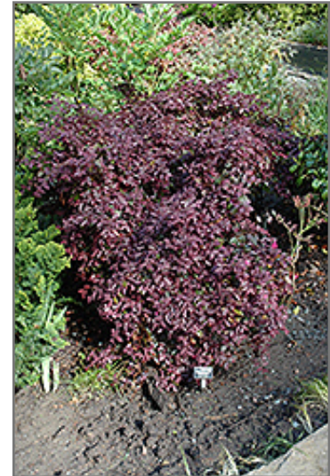
Burgundy Fringeflower