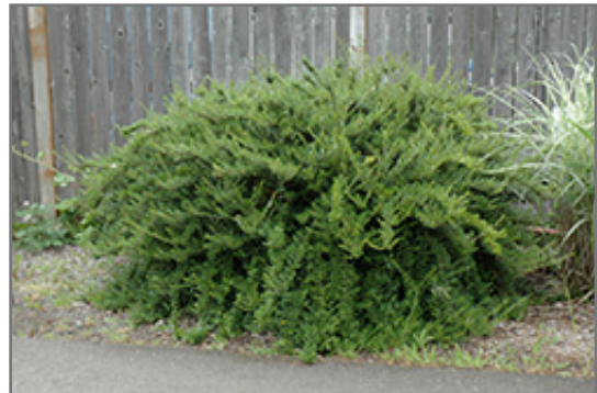
Box Honeysuckle

Box Honeysuckle is recommended for the following landscape applications;