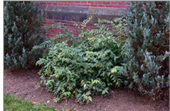
Rainbow Fetterbush