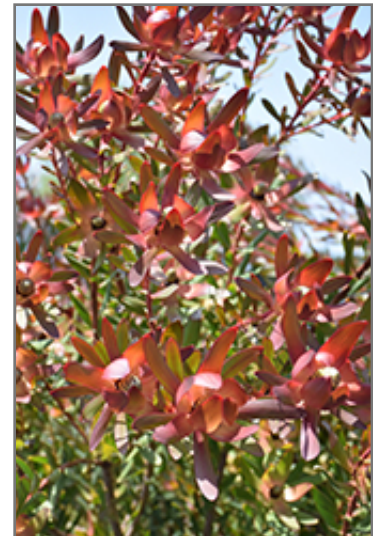
Safari Sunset Conebush flowers

Safari Sunset Conebush is recommended for the following landscape applications;