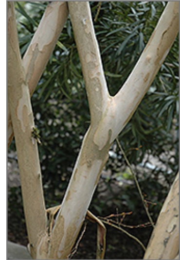
Zuni Crapemyrtle bark

Zuni Crapemyrtle makes a fine choice for the outdoor landscape, but it is also well-suited for use in outdoor pots and containers. Because of its height, it is often used as a 'thriller' in the 'spiller-thriller-filler' container combination; plant it near the center of the pot, surrounded by smaller plants and those that spill over the edges. It is even sizeable enough that it can be grown alone in a suitable container. Note that when grown in a container, it may not perform exactly as indicated on the tag - this is to be expected. Also note that when growing plants in outdoor containers and baskets, they may require more frequent waterings than they would in the yard or garden.