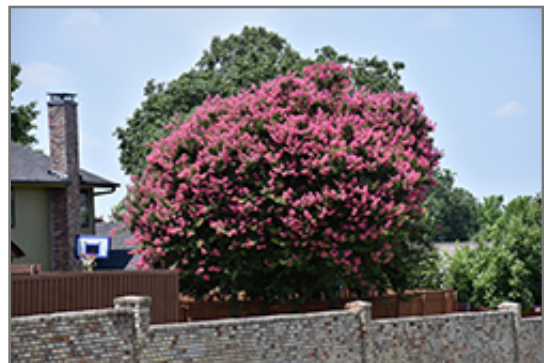
Zuni Crapemyrtle in bloom