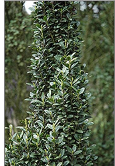
Sky Sentry Japanese Holly foliage