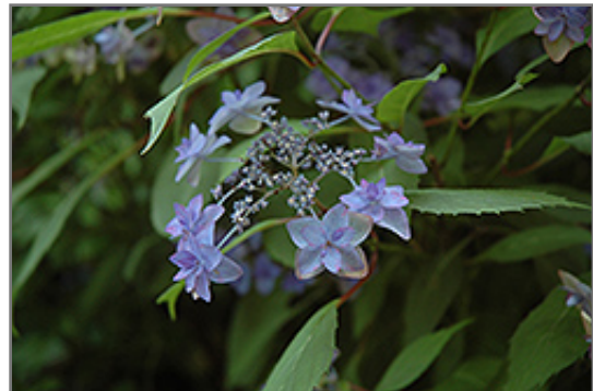
Miyama Yae Murasaki Hydrangea flowers

Miyama Yae Murasaki Hydrangea will grow to be about 4 feet tall at maturity, with a spread of 4 feet. It has a low canopy. It grows at a medium rate, and under ideal conditions can be expected to live for approximately 30 years.