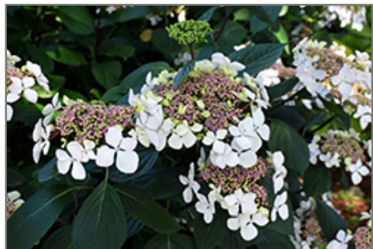
Midnight Duchess Hydrangea flowers