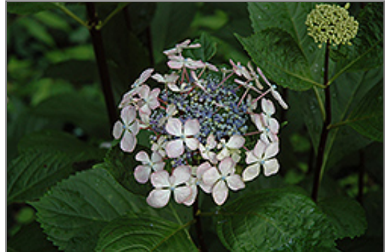
Midnight Duchess Hydrangea flowers

Midnight Duchess Hydrangea is recommended for the following landscape applications;