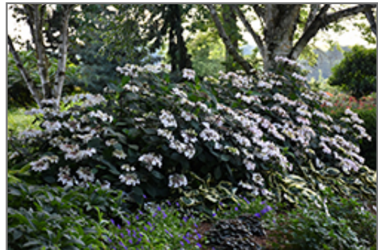
Midnight Duchess Hydrangea in bloom

Midnight Duchess Hydrangea will grow to be about 5 feet tall at maturity, with a spread of 5 feet. It tends to be a little leggy, with a typical clearance of 1 foot from the ground, and is suitable for planting under power lines. It grows at a fast rate, and under ideal conditions can be expected to live for approximately 20 years.