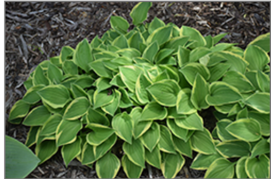
Rock Island Line Hosta