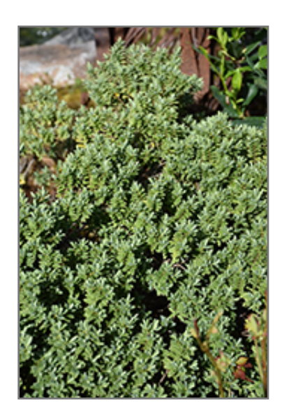
Sutherland Hebe foliage

8546 Sun Valley Road Anytown, USA 12345 204.782.4147