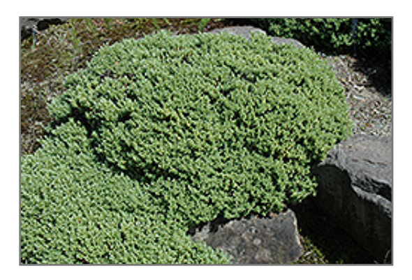
Sutherland Hebe

Sutherland Hebe is recommended for the following landscape applications;