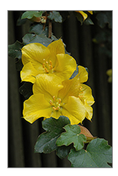
California Glory Fremontodendron flowers

California Glory Fremontodendron is recommended for the following landscape applications;