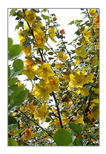
California Glory Fremontodendron flowers

This shrub should only be grown in full sunlight. It prefers dry to average moisture levels with very well-drained soil, and will often die in standing water. It may require supplemental watering during periods of drought or extended heat. It is not particular as to soil pH, but grows best in sandy soils. It is somewhat tolerant of urban pollution. This particular variety is an interspecific hybrid.