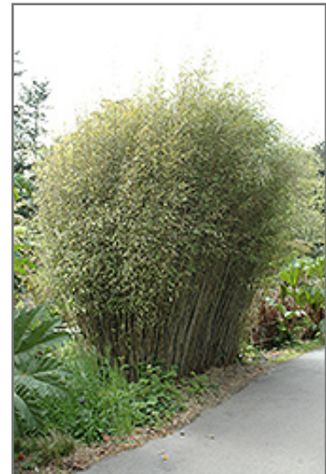
Blue Fountain Bamboo