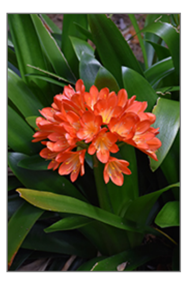
Bush Lily flowers