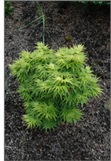
Mikawa Yatsubusa Japanese Maple

Mikawa Yatsubusa Japanese Maple is a fine choice for the yard, but it is also a good selection for planting in outdoor pots and containers. With its upright habit of growth, it is best suited for use as a 'thriller' in the 'spiller-thriller-filler' container combination; plant it near the center of the pot, surrounded by smaller plants and those that spill over the edges. It is even sizeable enough that it can be grown alone in a suitable container. Note that when grown in a container, it may not perform exactly as indicated on the tag - this is to be expected. Also note that when growing plants in outdoor containers and baskets, they may require more frequent waterings than they would in the yard or garden.