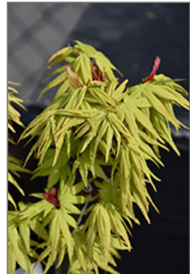
Mikawa Yatsubusa Japanese Maple foliage

Mikawa Yatsubusa Japanese Maple is recommended for the following landscape applications;