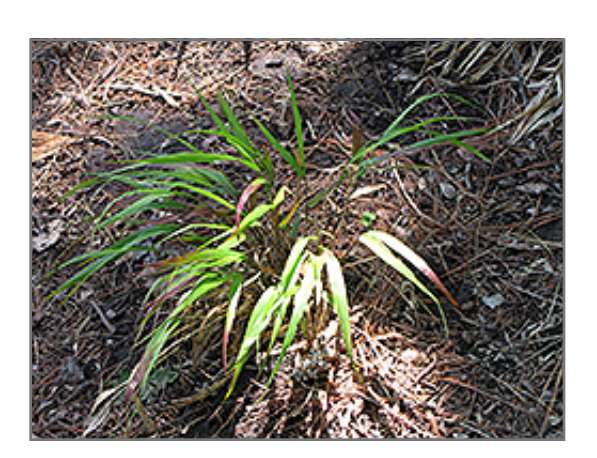
Red Wind Hakone Grass