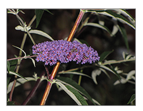
Ellens Blue Butterfly Bush flowers