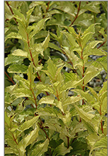
Ghost Weigela foliage