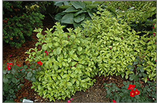
Ghost Weigela

This shrub should only be grown in full sunlight. It prefers to grow in average to moist conditions, and shouldn't be allowed to dry out. It may require supplemental watering during periods of drought or extended heat. It is not particular as to soil type or pH. It is highly tolerant of urban pollution and will even thrive in inner city environments. This is a selected variety of a species not originally from North America.