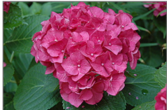
Merritt's Supreme Hydrangea flowers

Merritt's Supreme Hydrangea is recommended for the following landscape applications;