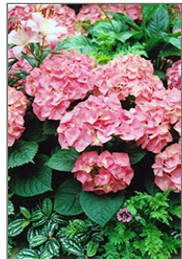
Merritt's Supreme Hydrangea flowers