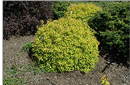
Lemon Princess Spirea