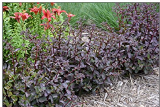
Bon Bon Showy Stonecrop