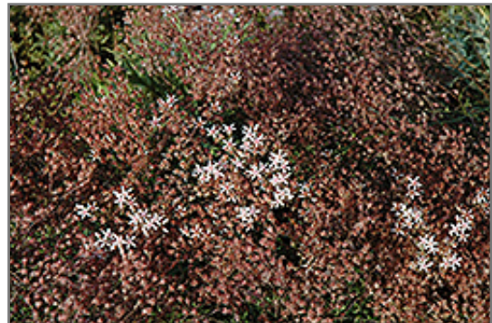
Royal Pink Stonecrop flowers