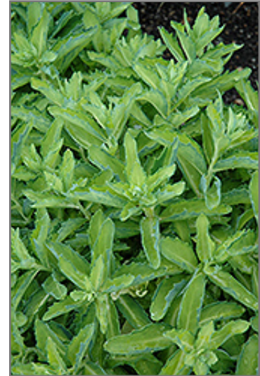
Autumn Delight Stonecrop foliage

Autumn Delight Stonecrop is a fine choice for the garden, but it is also a good selection for planting in outdoor pots and containers. It is often used as a 'filler' in the 'spiller-thriller-filler' container combination, providing a mass of flowers and foliage against which the larger thriller plants stand out. Note that when growing plants in outdoor containers and baskets, they may require more frequent waterings than they would in the yard or garden.