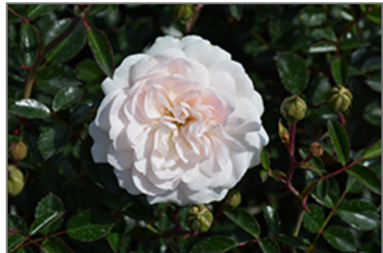
Sea Foam Rose flowers