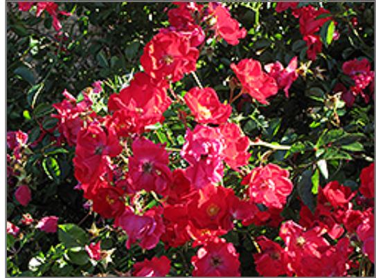
Flower Carpet Red Rose flowers

This shrub should only be grown in full sunlight. It does best in average to evenly moist conditions, but will not tolerate standing water. It may require supplemental watering during periods of drought or extended heat. It is not particular as to soil type or pH. It is somewhat tolerant of urban pollution. This particular variety is an interspecific hybrid.