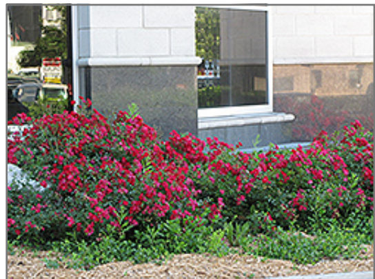
Flower Carpet Red Rose in bloom