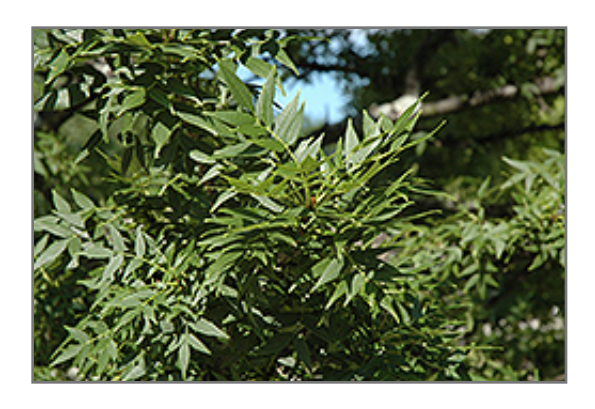
Leprechaun Green Ash foliage