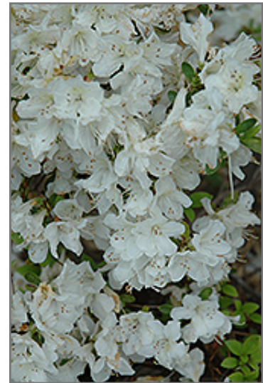
Snow White Azalea flowers

Snow White Azalea will grow to be about 6 feet tall at maturity, with a spread of 8 feet. It tends to be a little leggy, with a typical clearance of 1 foot from the ground, and is suitable for planting under power lines. It grows at a slow rate, and under ideal conditions can be expected to live for 40 years or more.