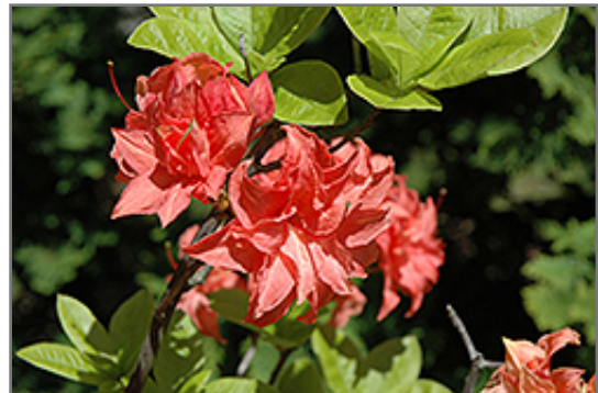
Salmon Delight Azalea flowers

Salmon Delight Azalea will grow to be about 7 feet tall at maturity, with a spread of 7 feet. It tends to be a little leggy, with a typical clearance of 1 foot from the ground, and is suitable for planting under power lines. It grows at a slow rate, and under ideal conditions can be expected to live for 40 years or more.