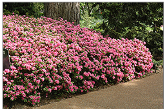
Mrs. Henry Schroeder Rhododendron in bloom