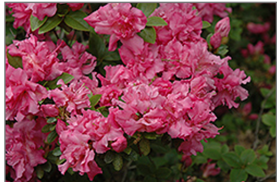
Mrs. Henry Schroeder Rhododendron flowers