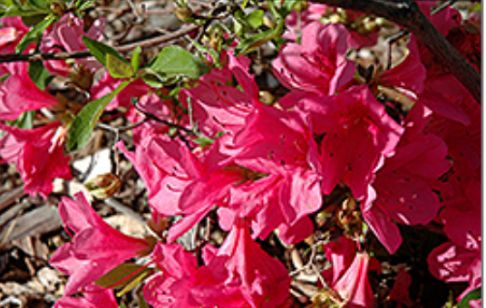
Ling Close Rhododendron flowers

Ling Close Rhododendron will grow to be about 5 feet tall at maturity, with a spread of 5 feet. It tends to be a little leggy, with a typical clearance of 1 foot from the ground, and is suitable for planting under power lines. It grows at a slow rate, and under ideal conditions can be expected to live for 40 years or more.